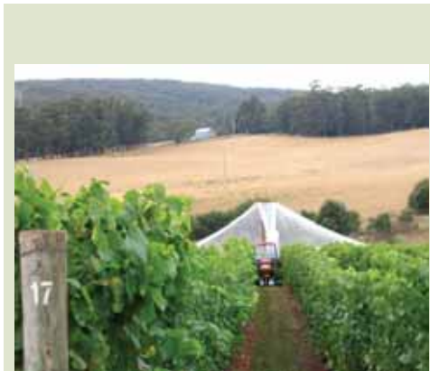
Our own "Heath-Robinson" contraption spreading nets across the Pinot Noir

Just fill out the enclosed order form and send it back via the reply paid envelope, or fax it to us on 03 6395 6211