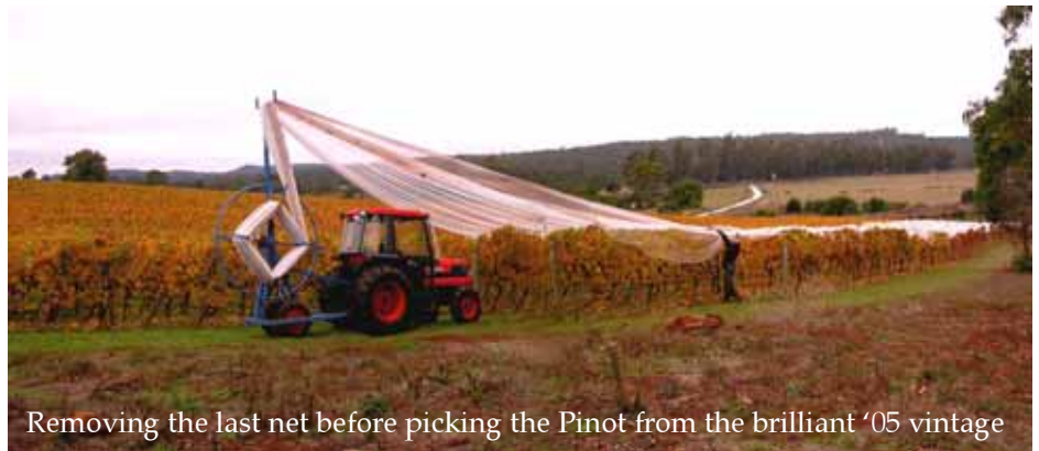
Removing the last net before picking the Pinot from the brilliant '05 vintage

If you’re planning a trip to Tassie around harvest time, you may like to join us and pick your own fruit as well. You can then truly say you’ve had a hand in the making of some of the wine in your cellar.